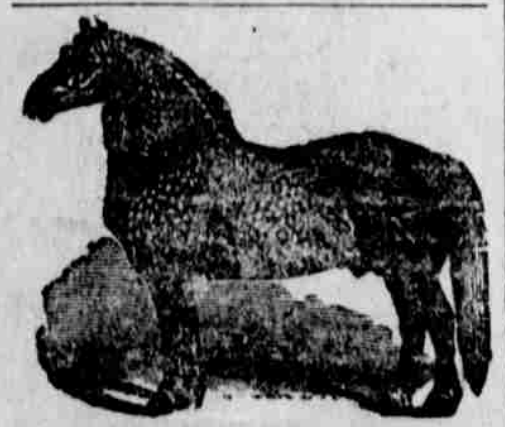
Republican Jr., 29348

Good Dray in connection with Livery Satisfaction guaranteed.