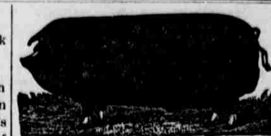
FINE THOROUGHBRED PIGS.

Court adjourned Wednesday morning until Monday next, when it is understood Judge Letton will be here and will preside until the end of the present term .- Herald.