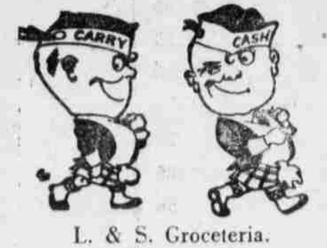
L. & S. Groceteria.