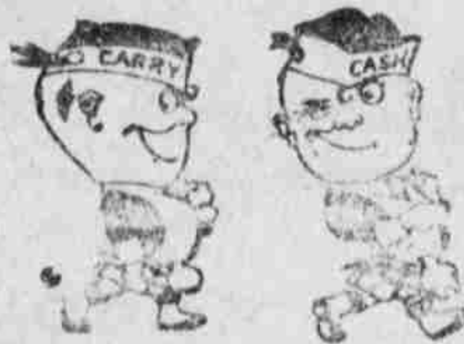
L. & S. Grocceria.