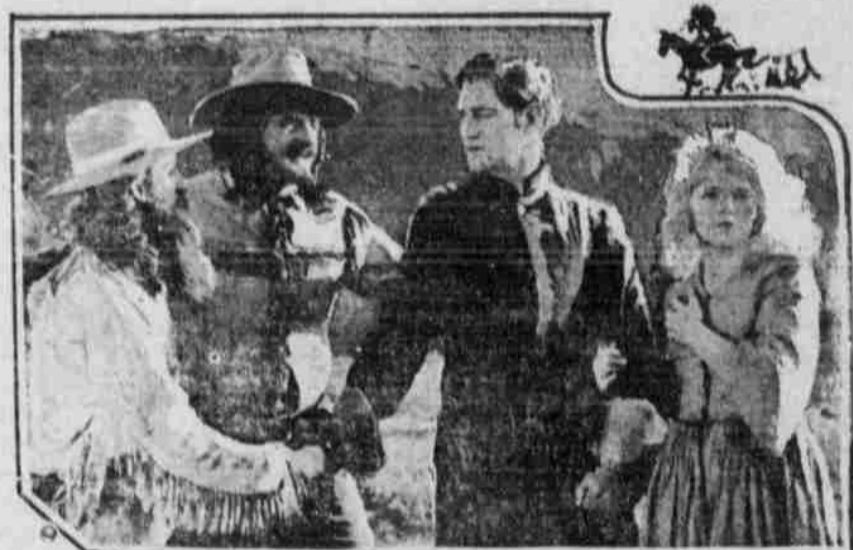
Scene from "IN THE DAYS OF BUFFALO BILL" A UNIVERSAL CHAPTER PLAY

SUN THEATRE, Friday and Saturday, Sept. 29 and 30.