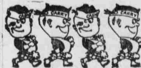
L. & S. Groceria.