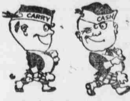
L. & S. Groceteria.

60c at all dealers. Foster-Milburn Co., Mfrs., Buffalo, N. Y.