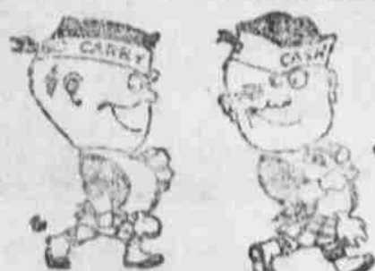
L. &amp; S. Groceria.