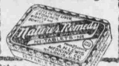
Got a 25c. Box Your Druggist