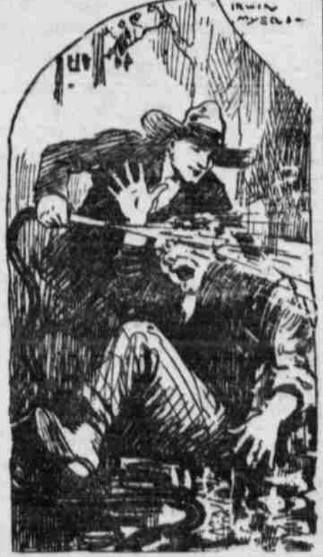
A Smothered "Vat T'e'll" Rose Out of the Waters.

stand what was happening to him. He did not know that he was being treated to a new form of the water cure.