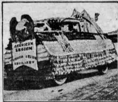
Legionnaires' Prize Float.

This year, the American Legion in all parts of Texas took part in the celebration of Colonel Houston's victory. The Legionnaires' float in the parade at Anson took first prize for being the best decorated of the scores that were seen on San Jacinto day.