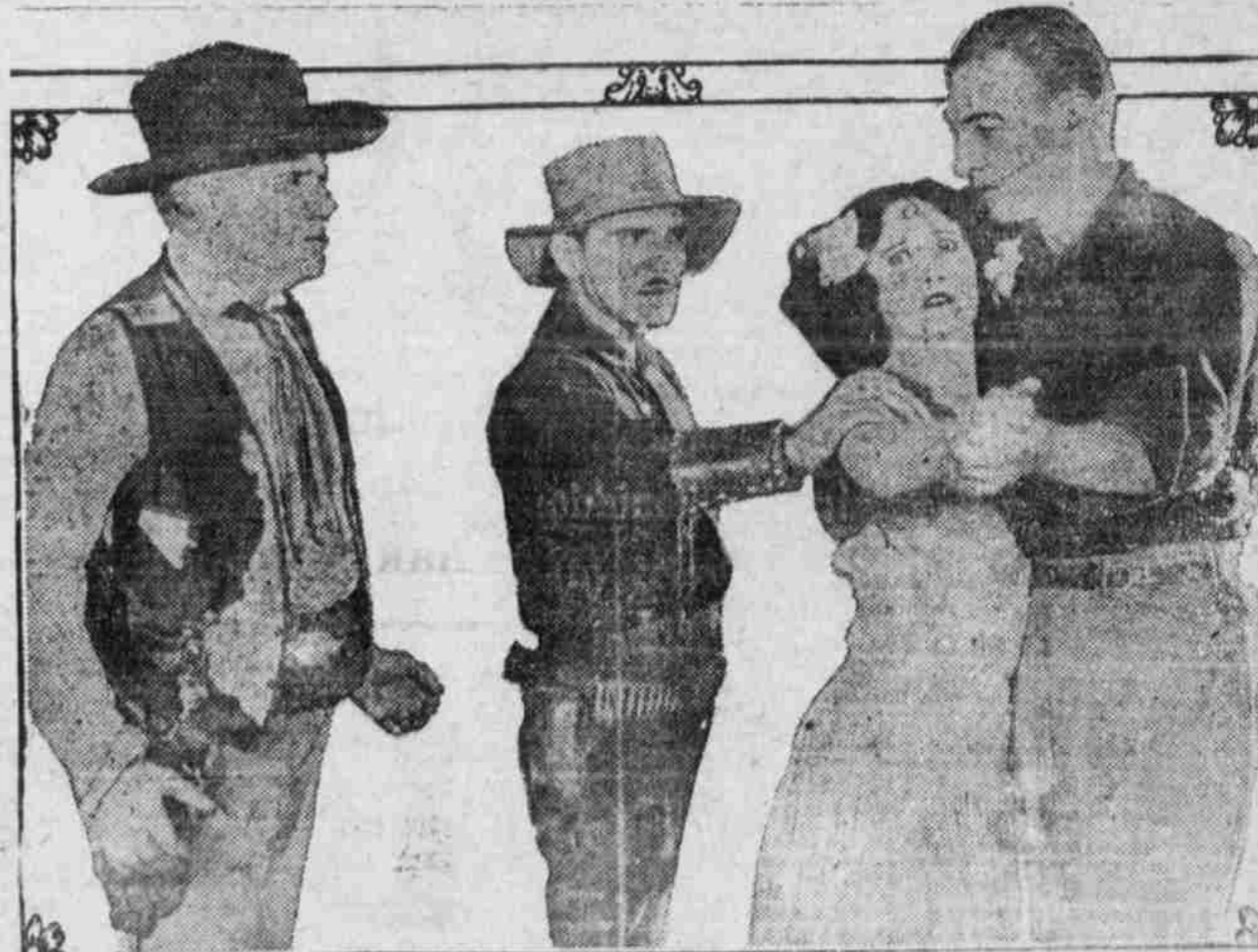
"THE LAST TRAIL" ~ WILLIAM FOX SPECIAL PRODUCTION ~

At the Sun Theatre, Sunday, Monday, Tuesday