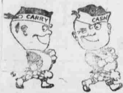
L. & S. Groceteria.

Get our FREE book, "An Easier Day's Work." Every woman should have this valuable book