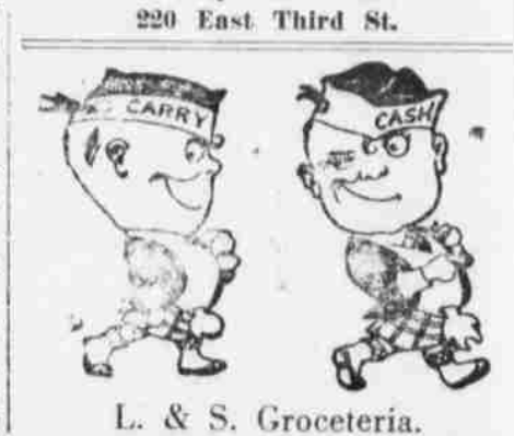
L. & S. Groceteria.