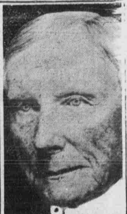
This is a new, exclusive and one of the few posed portraits of John D. Rockefeller, reputed the world's richest man and founder of the Standard Oil Company.

New spring styles in dress goods and silks, now on sale. The Leader Mercantile Co.