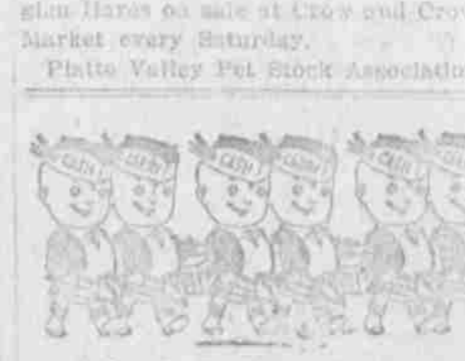
L. & S. Groceries.

FOR SALE We will have young crossed Belgian Hares on sale at Cro's and Crow Market every Saturday. Platte Valley Fox Stock Association.