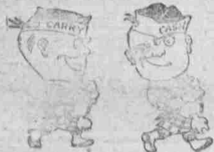
L. & S. Groceries.