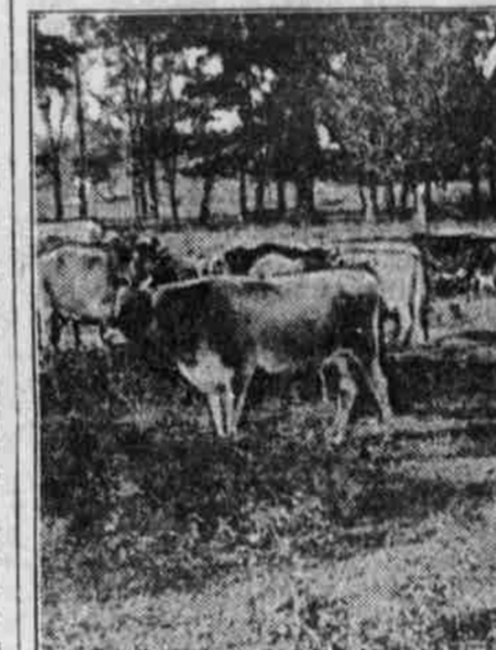
One of Most Economical Feeds for Dairy Cows is Pasture.

When the dry roughage is of poor quality, such as coarse, woody hay or a poor grade of cornstalks, a large portion can often be given to advantage, allowing the cow to pick out the best and using the rejected part for bedding. With this quantity of dry roughage the cow will take, according to