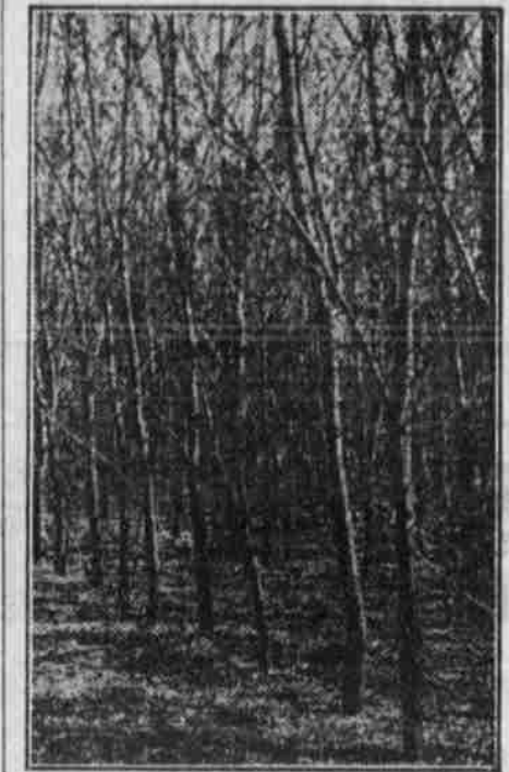
Black Locust Plantation—Five-Year-Old Trees.

Investigate local timber requirements and prices. Your products