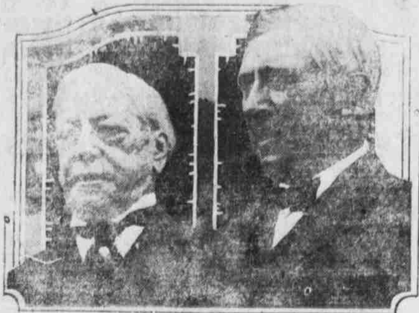
The above photograph was taken at the unemployment conference in Washington. It shows Samuel Gompers (on left) standing side by side with Charles M. Schwab, the country's greatest steel magnate.