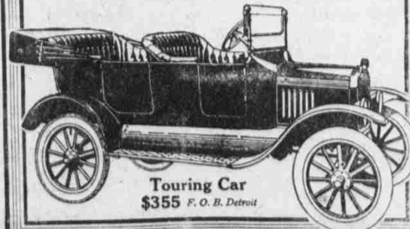
Touring Car $355 F. O. B. Detroit