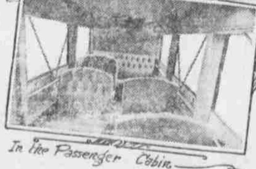
Cross section of passenger carrying plane

Now that the dirigible has added one more ghastly tragedy, will the airplane be the air vehicle of the future? Above is an English passenger plane which makes regular schedules at a charge of eight cents a mile. It carries eight people and 30 pounds of baggage for each. The partition between the engine and passengers' cabin is sound proof. Copyrighted article by special arrangement with Popular Science Monthly.