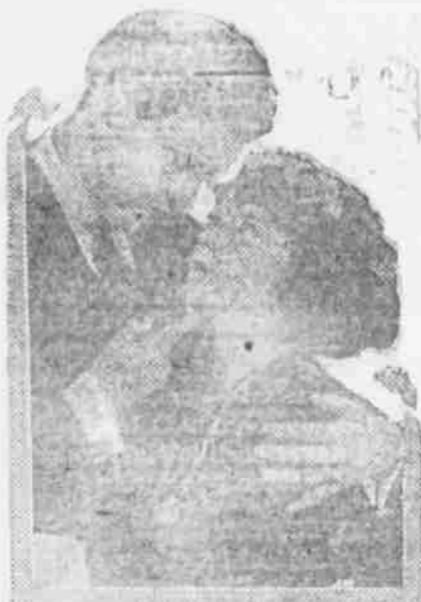
VIOLA DANA in "CINDERELLA'S TWIN"