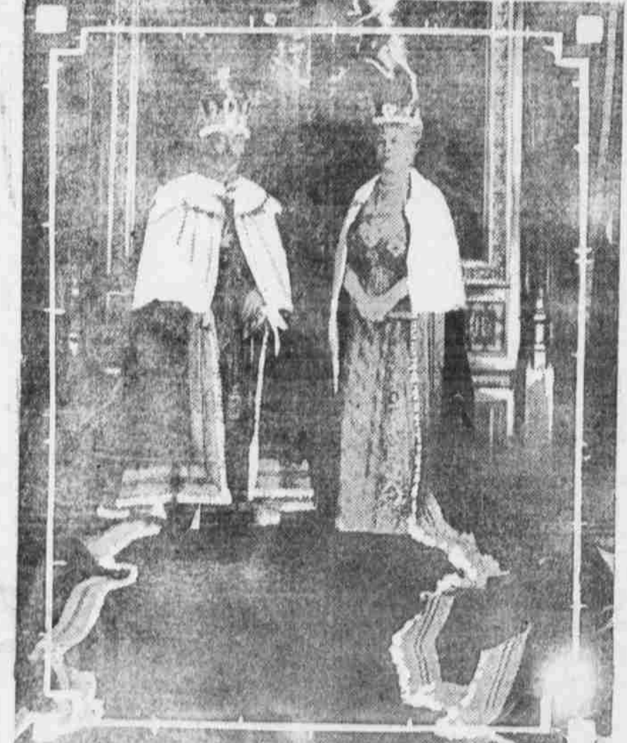
Here is his majesty, the King of England, and her highness, the Queen, in their royal robes of purple on the throne and with their coat of arms on royal plush back of them, ruling at the opening of Ulster parliament at Belfast, Ireland, while 4,000 soldiers and 1,000 constables guarded their lives.