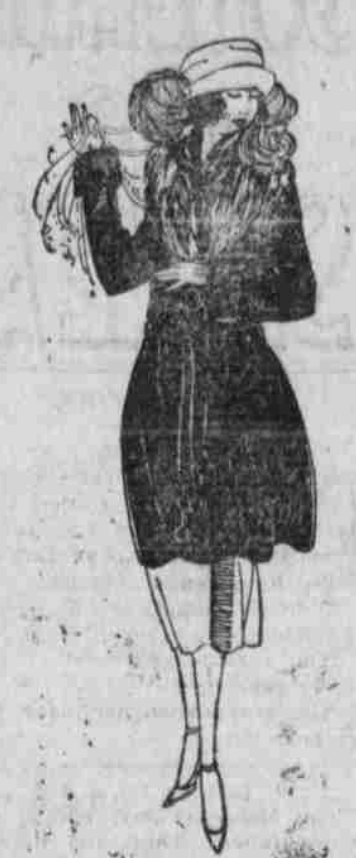
Coatees of Lapinex Plush, trimmed with deep shawl collar of deep shawl collar of fine quality Racoon, fancy sash belt fin-ished with two orna-ments. Lined thru-out with fancy Satin de Chine and warmly interlined. Length 36 inches.