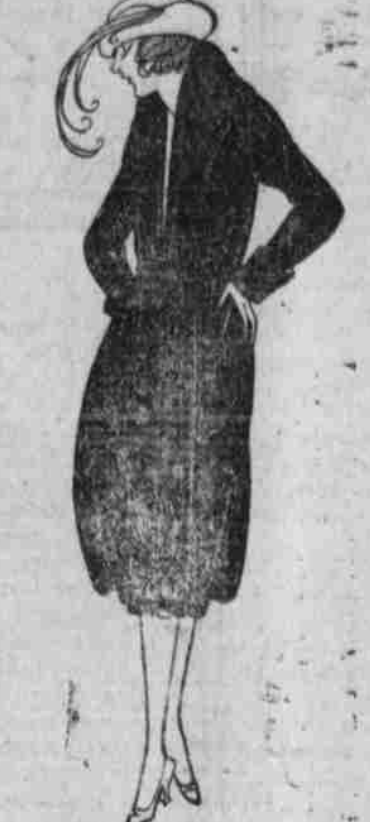
Novelty Coat of Lap. Novelty Coat of Lap-inex Plush, large convertible Tuxedo Revere in front can be worn closed, deep pointed collar trim-med with large silk tassel, convertible belt finished with two fancy tassels. Lined throughout with fancy silk and warmly interlined. Length 42 inches.