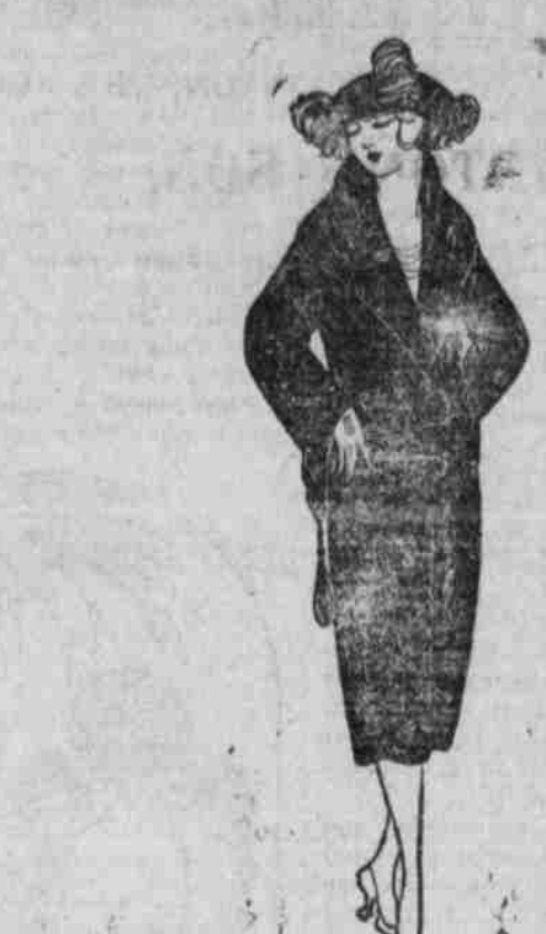
No. 4808 Wrap of Lapinex Plush, deep novelty cape collar trimmed in back with fancy silk tassel, novelty sleeves finished with fancy silk tassels. Lined throughout with fancy silk and warmly interlined. Length 42 inches. $39.65