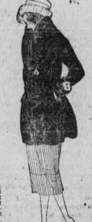
Coat of Lapinex Plush, trimmed with deep shawl collar, curs, and ten-inch