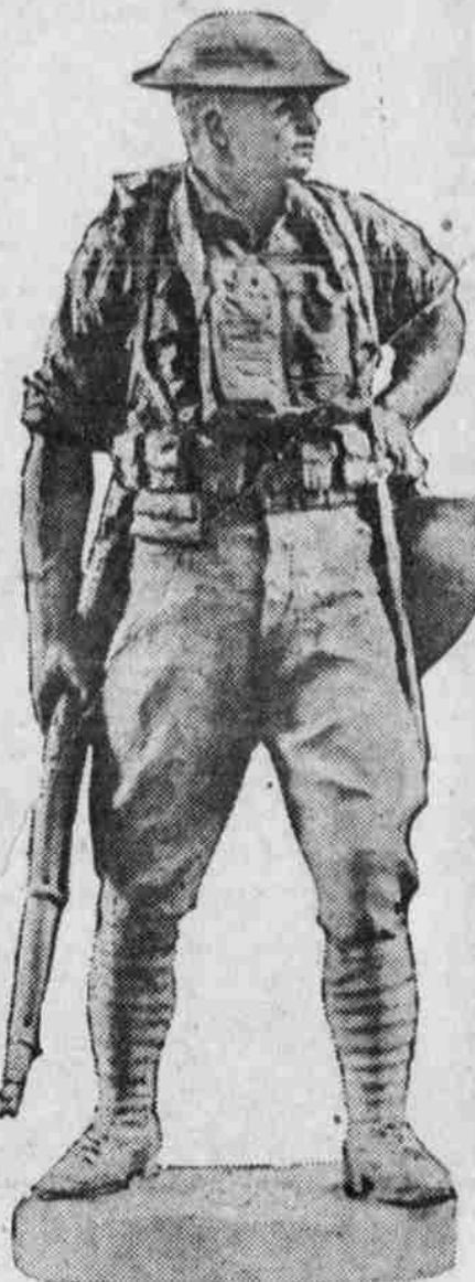
Statue Adopted by Idaho.