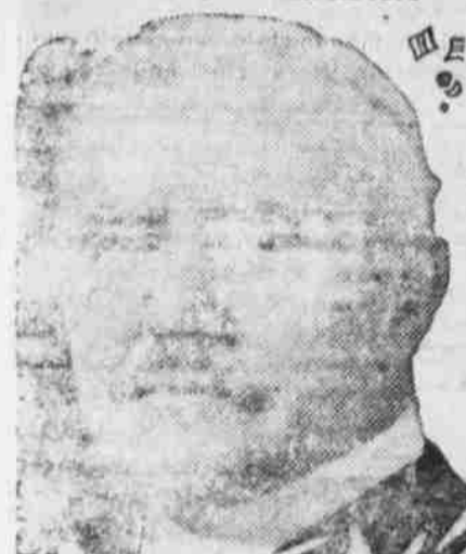
HON. SCOTT C. BONE

Washington.—One of the most popular and efficient appointments yet made by the new administration, is that of Scott C. Bone, who has just been nominated by President Harding as governor of Alaska. Mr. Bone, who is one of the best known of American newspaper editors, was publicity manager of the Republican national committee last year. Previously, as editor of the Seattle Post-Intelligencer, he gave careful attention and study to Alaskan matters and it is expected that he will make a strong governor from the very start. Mr. Bone has large experience with the problems of news print paper, and inasmuch as Alaska is a large great field for paper pulp, there is no doubt that he goes to Alaska with this matter very much in mind. Which is a case of expediency in the right place. Mr. Bone will leave very shortly for the territory he is to govern.