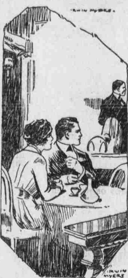
"That is One of the Men You Will Probably Have to Kill."

"The trouble," she began after a moment, "is that there is not very much to tell. At present it is largely guess work, and guess work without much of a clue. However, to start with, I had better tell you what sort of men you are up against. Firstly, Henry Lakington—the man who spoke to me. He was, I believe, one of the most brilliant scientists who has ever been up at