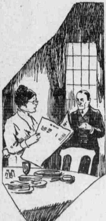
"Demobilized Officer," She Read Slowly, "Finding Peace Incredibly Tedious, Would Welcome Diversion."

The worthy woman snorted. "He has not, sir—not yet, leastwise. And if so be that he does"—her eyes traveled up and down the back of the hapless Denny, who was quite uncer-