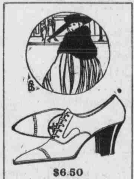
Illustration at right comes in brown or black kid with Cuban heel

This store is fairly teeming with the EASTER SPIRIT. The bright bloom of spring radiates throughout every department. Every style we feature is UNUSUAL in style as well as quality.