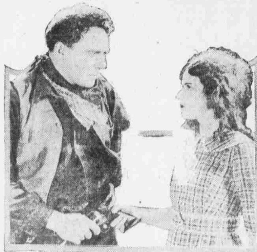
"THE GREAT REDEEMER"

This is a picture and sermon combined. A wonderful picture at the same old price. Also another 2-reel Harold Lloyd Comedy. A show by itself.