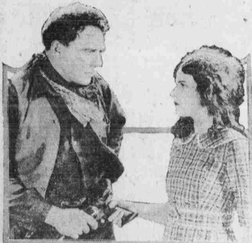
"THE GREAT REDEEMER"

This is a picture and sermon combined. A wonderful picture at the same old price. Also another 2-reel Harold Lloyd Comedy. A show by itself.