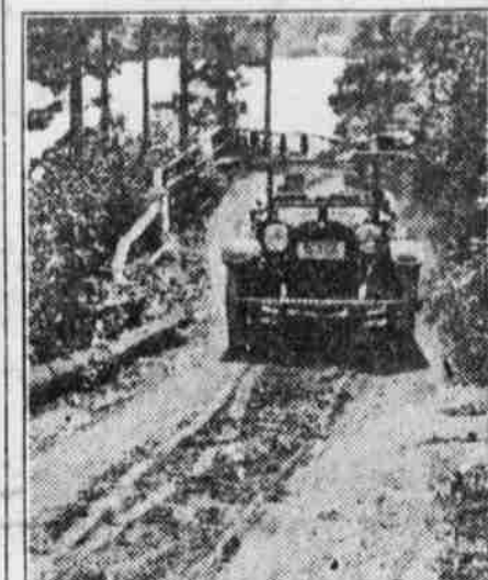
Good Roads Mean Greater Rural Comfort and Prosperity.

"If the states continue to pay more than 50 per cent of the cost, as they have in the past, the cost of the roads constructed with this last apportion-