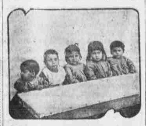
The Table Is Now 24 Miles Long.

But there the table is, sented on both sides with orphans-Syrian and