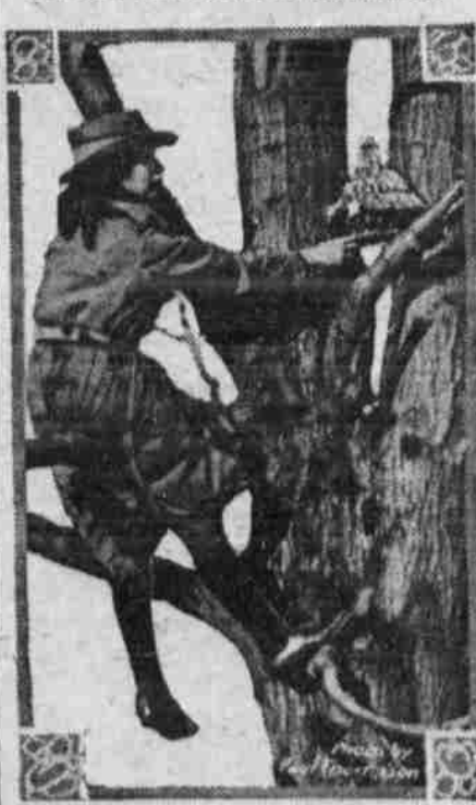
The girl scouts of New York city have undertaken to provide homes for the birds that wish to spend the winter there. One of them is here seen putting up a bird house in a tree in Central park.