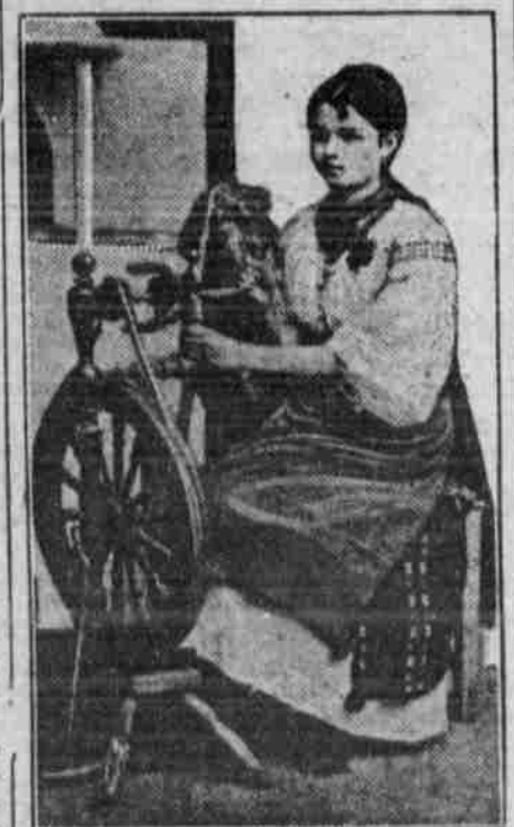
Ukraine Peasant Girl.

"The Ukraine includes southeastern Russia, with the exception of the province known as Bessarabia, which