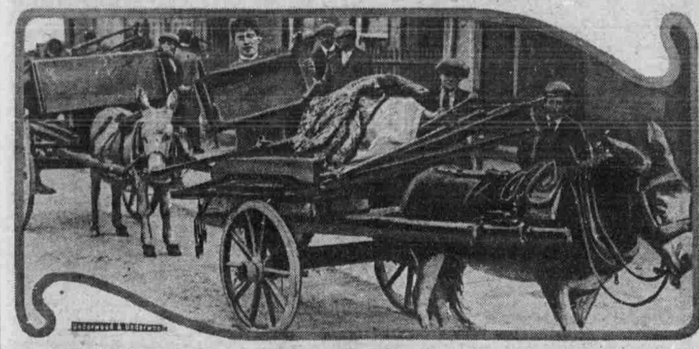
Residents of Mallow, county Cork, Ireland, fleeing with such furniture as they could save, from their town, which British troops burned and sacked in reprisal for raids by Sinn Fein sympathizers.