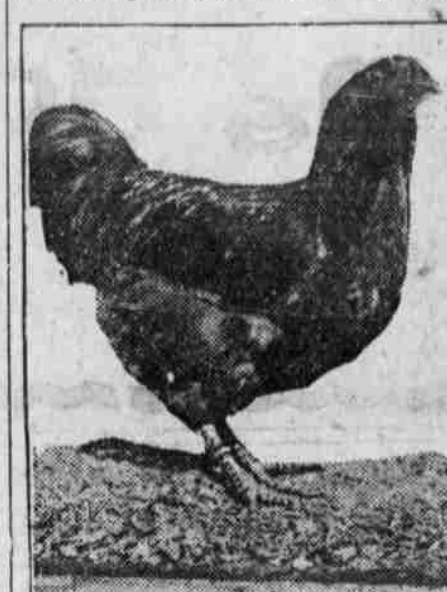
Good Specimen of Capon.

Dry Picking is Best. Capons should always be dry picked, as they look much better and as some of the feathers should be left on. The feathers of the neck and head, the tail feathers, those a short way up the back, the feathers of the last two joints of the wing, and those of the leg, about one-third of the way from knee to hip joint, should be left on. These feathers, together with the head of the capon, serve to distinguish it from other classes of poultry on the market, and consequently should never be removed. In packing, be careful not to tear the skin. Bad tears, poultry specialists of the United States department of agriculture say.