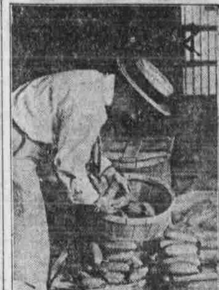
Federal Inspector Ascertaining Condition of Shipment of Cucumbers.

More than 25,000 inspections of fruits and vegetables moving in interstate commerce were made by representatives of the bureau of markets, United States department of agriculture.