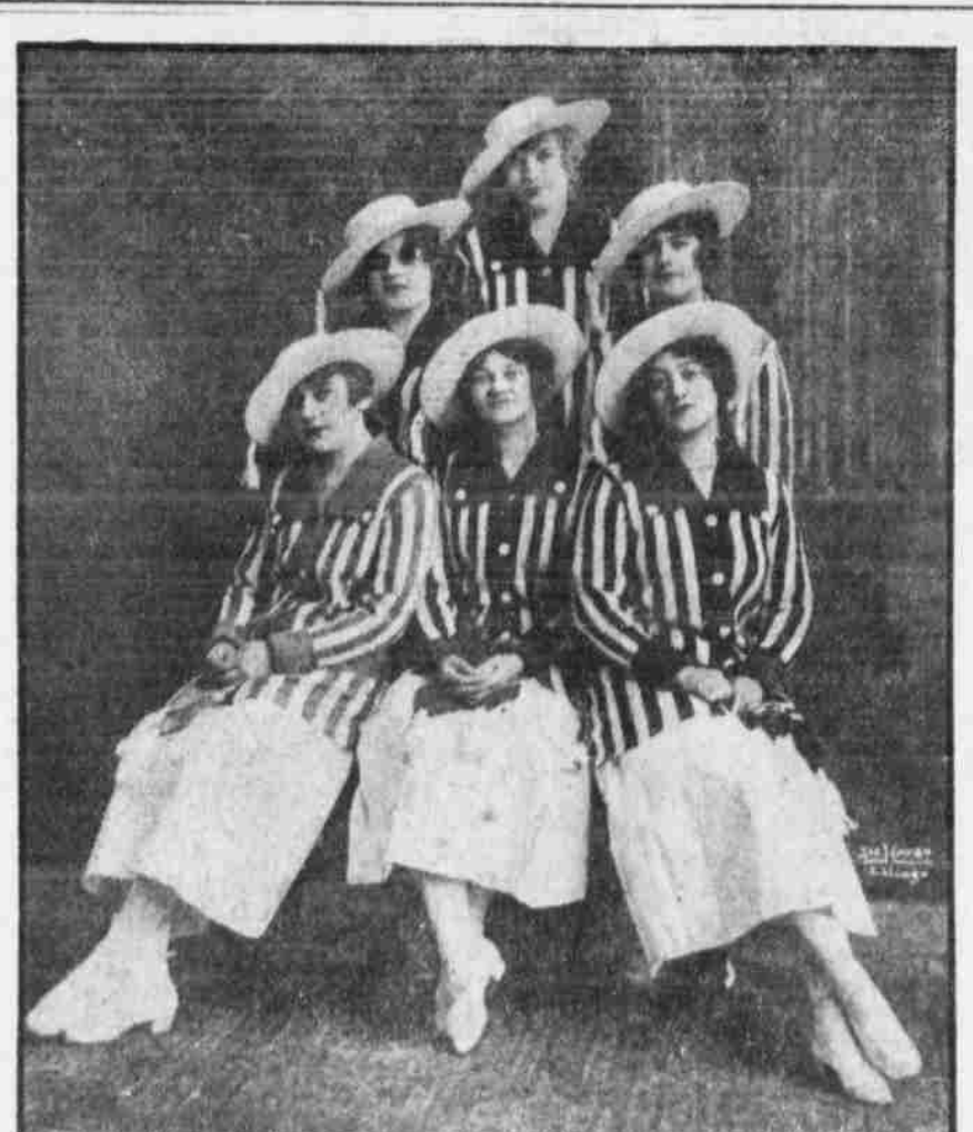
A group of pretty girls with "The Gumps" coming to the Keith Theatre tonight.

510 LOCUST ST. 3 doors N. Post Office Phone 240