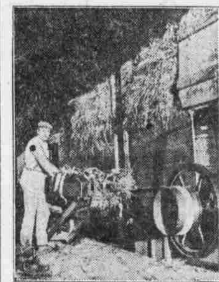
Silage Cutter in Operation, Showing Connection With Engine.

Roughly speaking it takes one and one-half to two horsepower gas for