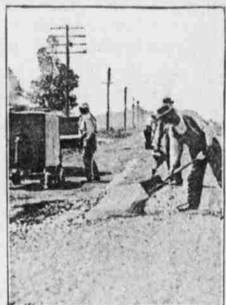
How the Nation's Highways Are Being Improved.

Certain of the states, notably Maryland, have experienced difficulty in securing road-building materials owing