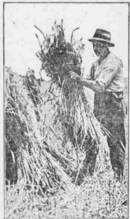
Stacking Wheat in Oregon.

Under the conditions prevailing before the World war, 35 per cent of the world's wheat crop was harvested in July, 25 per cent in August, 15 per cent in June, 7 per cent in April, 5 per cent in January, 4 per cent in May, 3 per cent each in March and December, 2 per cent in September, 1 per cent each in February and November. The wheat harvest of the world may be regarded as beginning in December in South America, Aus-