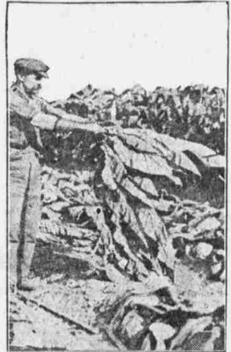
Harvesting Tobacco by Cutting the Stalk, Showing the Method of Spearing the Plant on the Stick.

Growing and Handling. The methods of growing and handling the crop must be varied according to the type of leaf which it is desired to produce, for the kind of tobacco is influenced very greatly by the methods of growing and handling which are employed. Certain methods