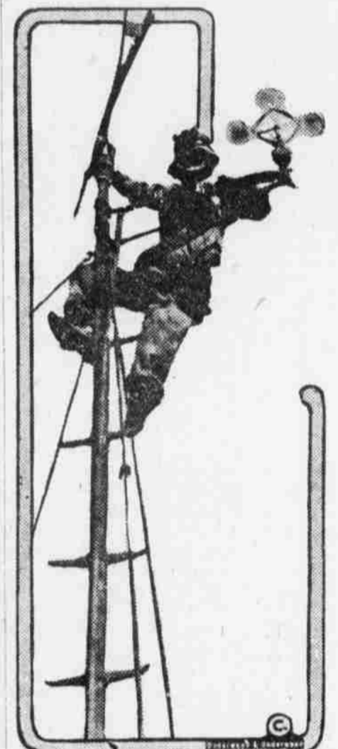
In order to preserve the delicate meteorological instruments on the dome of the federal building in Chicago from the effects of weather and to insure their operation at all times, it is necessary for them to be cleaned and oiled every day, especially in the case of the revolving wind recorder, which surmounts the top of the steel pole on the highest point of the dome. The top of this pole is about 300 feet high. To attend to this work, Harry Brostoff, wearing a gas mask, has to climb the pole by means of a steel ladder every morning in all kinds of weather. This task is particularly difficult and hazardous on stormy or windy days.