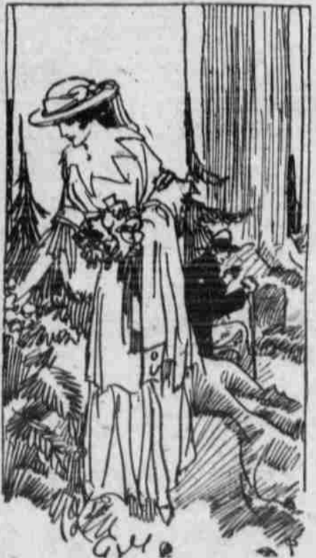
"Who is it?"

Shirley had not intended to come here, but now that she had arrived, it occurred to her that it was here she wanted to come. Parking her car by the side of the road, she alighted and proceeded up the old skid, now newly planked and with the encroaching forestation cut away so that the daylight might enter from above. On over the gentle divide she went and down toward the amphitheater where the primeval giants grew. And as she approached it, the sound that is silence in the redwoods—the thunderous diapason of the centuries—wove its spell upon her; quickly, imperceptibly there faded from her mind the