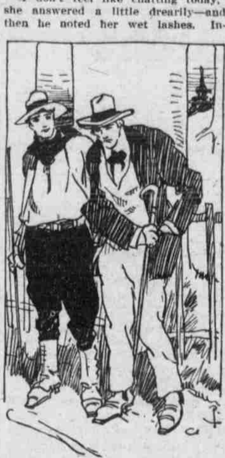
"I Wouldn't Lose That Handkerchief for a Farm."

"I don't feel like chatting today," she answered a little drearly—and then he noted her wet lashes. In-