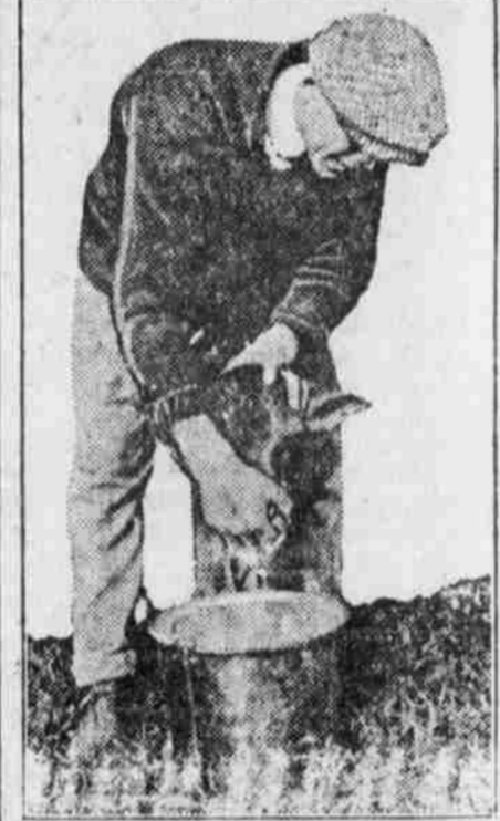
Heavy Skim Milk Rations, It Has Been Found, Are Beneficial for Calves.

No bad results from heavy feeding were noticed, although all of the calves