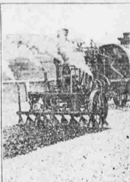
Helping Carry Forward the Nation's Great Road Building Program, Support of Which is Urged by Secretary Meredith of the Department of Agriculture.

Manufacturers of road materials, as well as the federal and state highway departments, have been inconvenienced, because materials that would meet the requirements of one state would be rejected in another often because of different interpretations of specifications. Much of this work is done co-operatively by the federal and