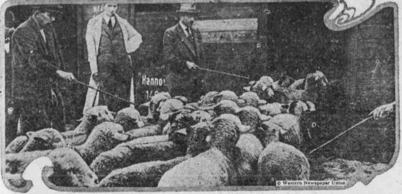
These Germans are sending a shipment of lambs into the devastated regions of France in accord with the terms of the peace treaty.