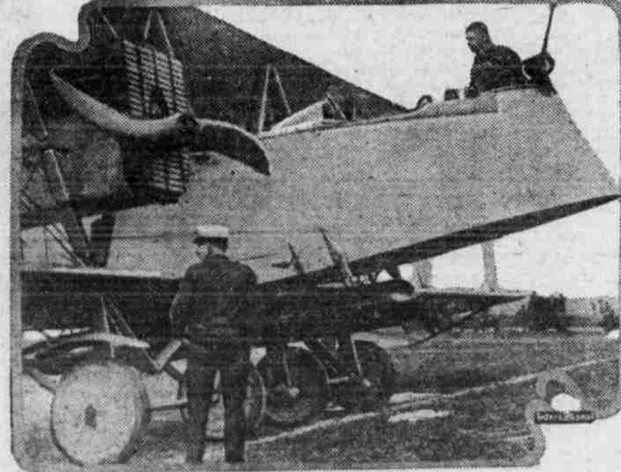
The new Martin bomber, known as the "torpedo plane," which carries beneath its fuselage a Whitehead torpedo with 200 pounds of TNT.