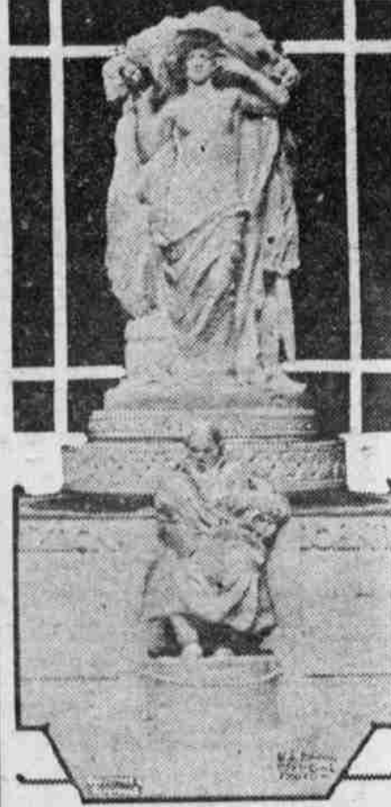
The monument to John Ericsson, the inventor of the monitor and the screw propeller, which will be placed in the hall at Washington. It will cost $65,000, paid partly by the government and partly by citizens of Swedish blood. The design is by J. E. Fraser.