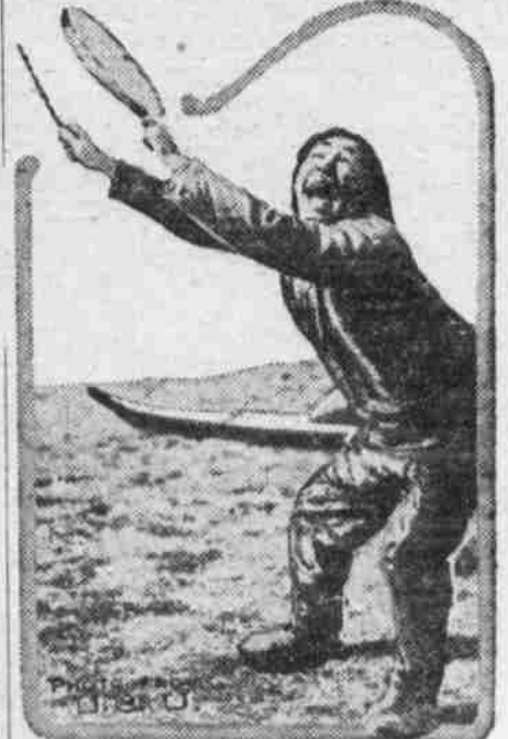
This Eskimo conjuror and medicine man knew about the "shimmy" long before it became popular in more tepid climes. His art of dancing consists of singing and shaking his body without moving his feet.