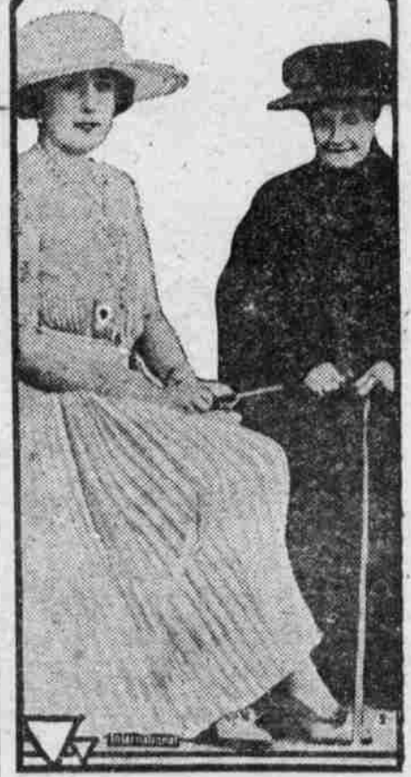
This photograph, just received in this country, was made by special permission of her majesty, the queen of Spain at Seville. It shows the ex-Empress Eugenie with the queen of Spain in the garden of the palace of the duke of Alba, the nephew of the ex-Empress. Eugenie celebrated her ninety-fifth birthday, May 5.