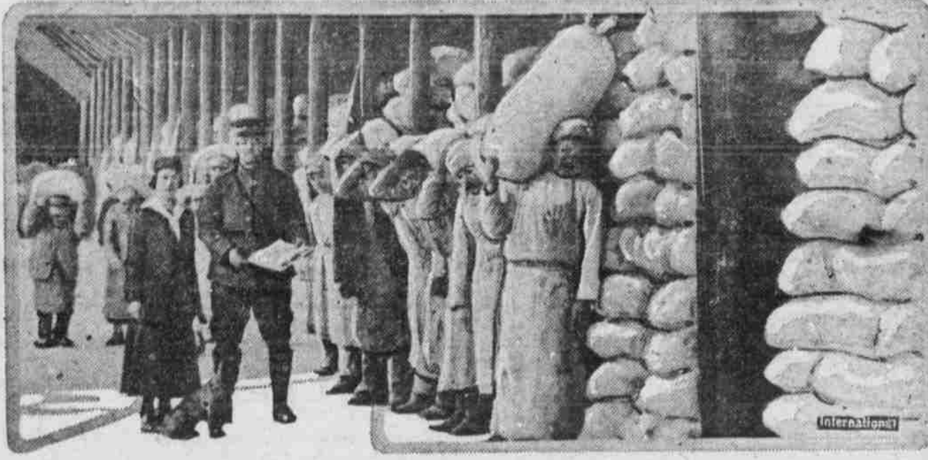
Tiflis, capital of the new state of Georgia, has been the headquarters of American relief work in the Caucasus and Armenia. This is a warehouse there filled with American flour for the starving Armenians.