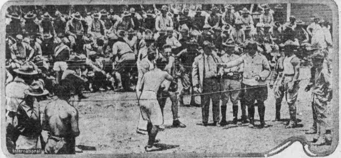
A boxing bout between American soldiers in the canal zone. These bouts are held once a week, under the direction of the Knights of Columbus.