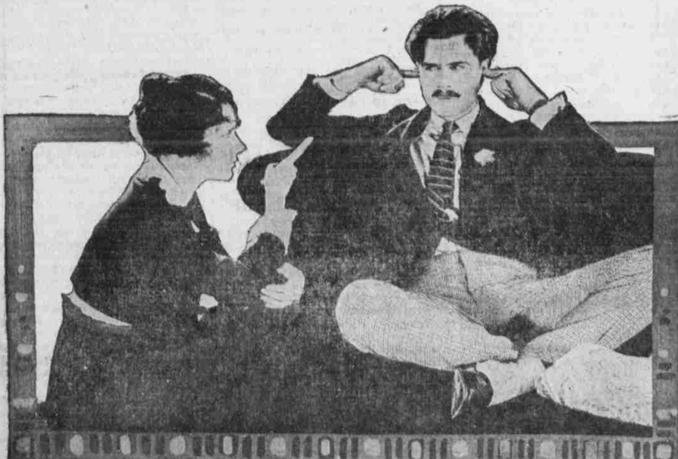
BERT LYTELL in "LOMBARDI, LTD."