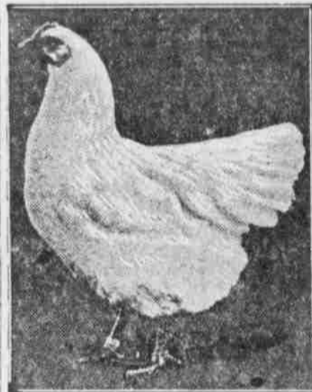
Purebred White Plymouth Rock Pullet.

Noteworthy success is reported by the United States department of agriculture in grading up mongrel flocks of poultry by the continued use of males of pure breeding. During the last fiscal year, according to a statement of the bureau of animal indus-