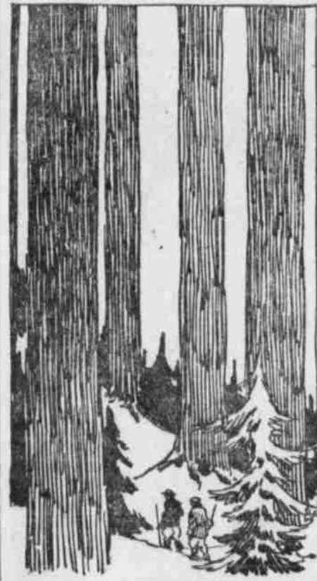
They Came at Length to a Little Amphitheater.

"Come with me, McTavish," he said to his woods-boss. They passed through a narrow gap between two low hills and emerged in a long narrow valley where the redwoods grew thickly and where the smallest tree was not less than fifteen feet in diameter and two hundred and fifty feet tall. McTavish followed at his master's heels as they penetrated this grove, making their way with difficulty through the underbrush until