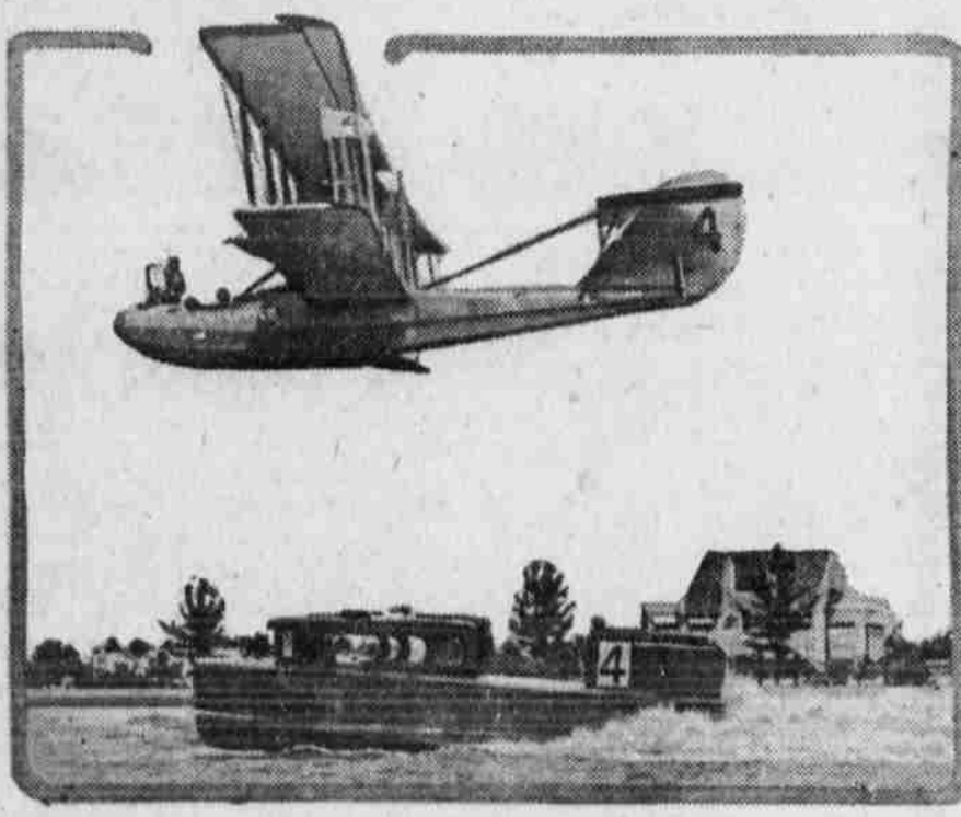
A remarkable photograph of a motorboat and airplane race, taking place over the same course at Miami, Fla. The boat is the Gar, Jr., owned by Gar Wood of New York, shown winning the 20-mile race for express cruisers and setting a new world record for its type.