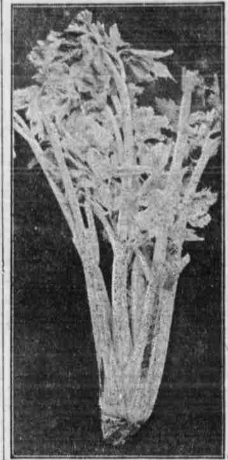
Celery May Be Planted After Some Early Crop.

For celery in the North, sow the seed in a hotbed or coldframe and transplant to the open ground. Celery plants are generally improved by transplanting twice. Celery seeds are very small and are slow in germination, and the temperature of the seed bed should be kept low. The seed bed should be especially well prepared, and the seeds should not be covered to a greater depth than one-eighth of an inch. Watering should be attended to very carefully and the bed should not dry out. After the plants are up, care should be taken that the bed