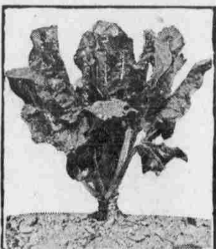
Swiss Chard Has Been Bred for Foliage for Salads Instead of Root.

Most young men haven't even a lame excuse for carrying a cane.