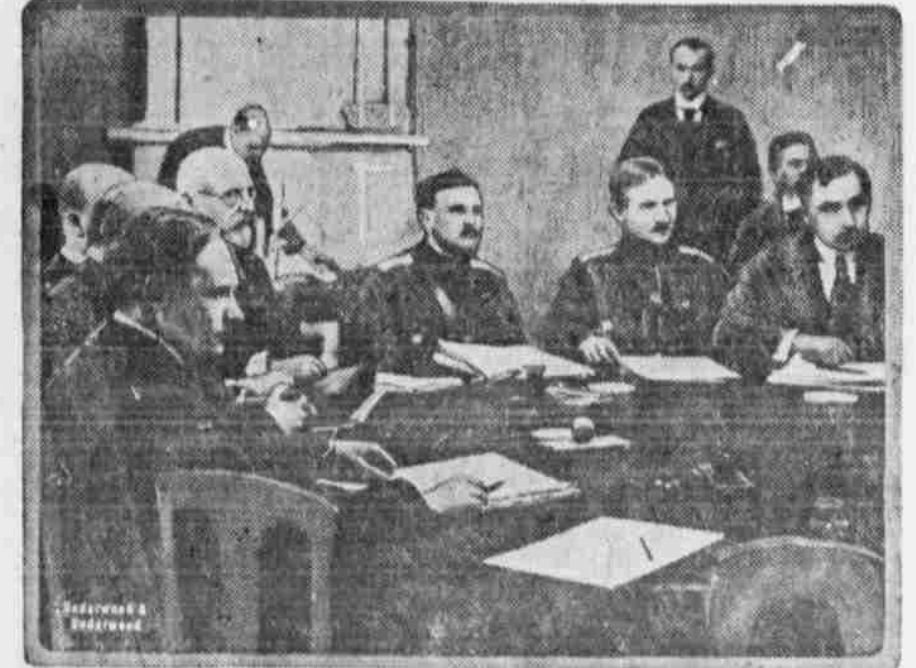
The Estonian delegates at the conference at Dorpat, signing the peace treaty between Estonia and the soviet government of Russia.