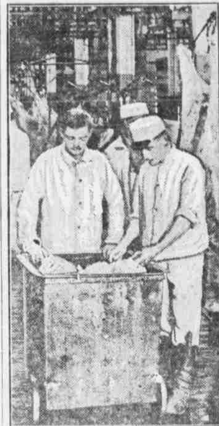
Inspectors at Work on Regular Post-mortem Examination.

"Contrary to the common belief that meat inspection is conducted principally for consumers, it has a side which is of direct help to live stock producers," says the chief of the bureau of animal industry. "In the first place, the bulk of our foreign trade in meats depends almost entirely on the federal meat-inspection service. Most foreign governments will not accept meat that has not been federally inspected. Inspection of import meats,