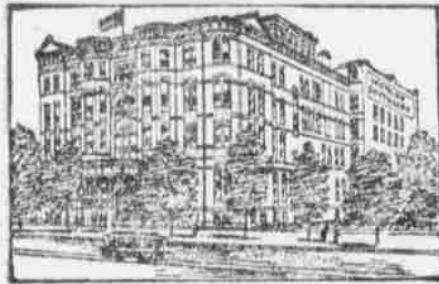
A WELL-KNOWN INSTITUTION.

"I have always maintained that alcohol is a food." "Me, too. Could you help a starving man?"