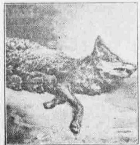
One of the Wolves, With Young, Killed by Hunters of Biological Survey.

Washington.—You would hardly think of the United States department of agriculture as an agency for hunting down desperadoes, but it is. That the desperadoes happen to be not men but wild animals does not detract either from the adventure or the value of the work.