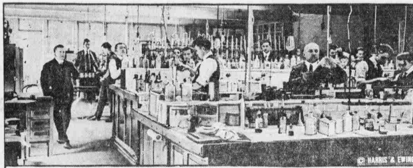
This is the government laboratory which gives the final answer on the alcoholic content of home brews which Uncle Sam's prohibition stenths seize. Hard cider, hair tonics, patent medicines, flavoring extracts, and all other forms of alcoholic drinks which the government samples will reach the same goal. The laboratory is in the treasury department where it has passed from the jurisdiction of the bureau of internal revenue to the federal prohibition commission.