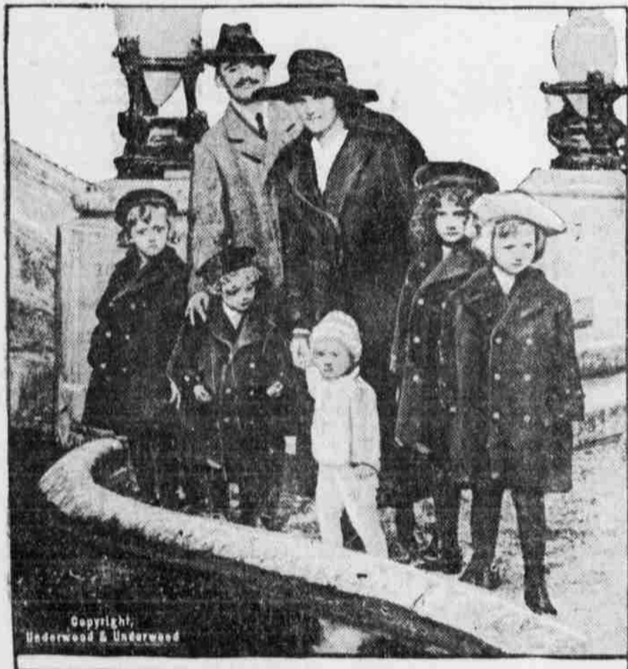
Ex-Emperor Charles of Austria, his wife, the ex-Empress Zita, and their children, photographed in the garden of their villa at Prangins, Switzerland.