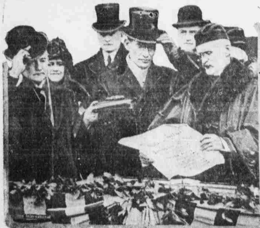
Gov. Edward J. Edwards of New Jersey, taking the oath of office in front of the state house in Trenton. Chief Justice William S. Gummere of the New Jersey supreme court, is shown administering the oath. Governor Edwards is an open opponent of prohibition, and his first official act was to send an anti-dry letter to the New Jersey assembly.