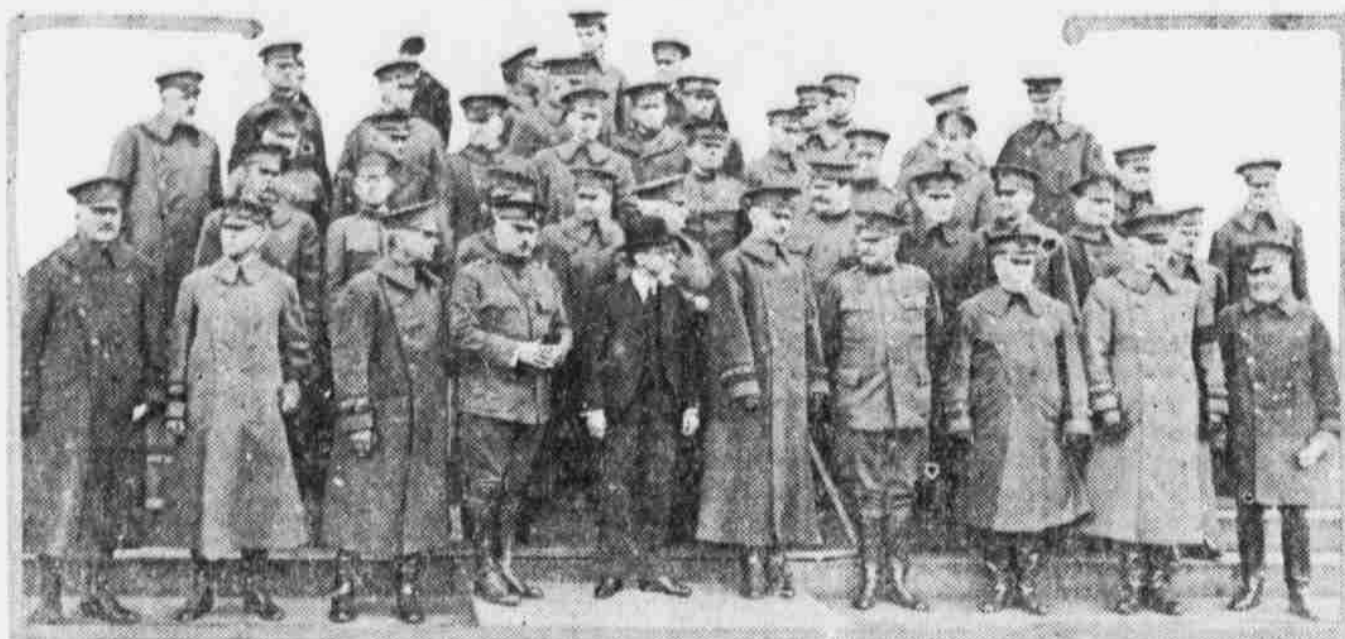
General officers of the United States army, with the exception of Pershing and one or two unable to attend, gathered at the war department for a momentous conference. This photograph of them with Secretary Baker, was taken in front of the war department.