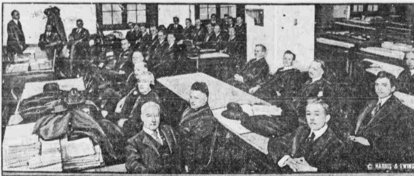
The treasury department is taking no chances on sending out green men to advise the public on income tax matters. All employees of the income tax division are trained in an intensive course of six weeks on every phase of the income tax schedule. This insures uniformity and accuracy. Here is one of the classes.