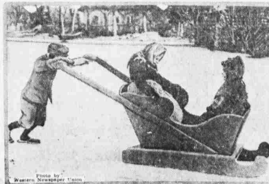
These three Dutch children are having as much fun with their old-fashioned sled on a duck pond as do American little ones with their bobbeds and skates.