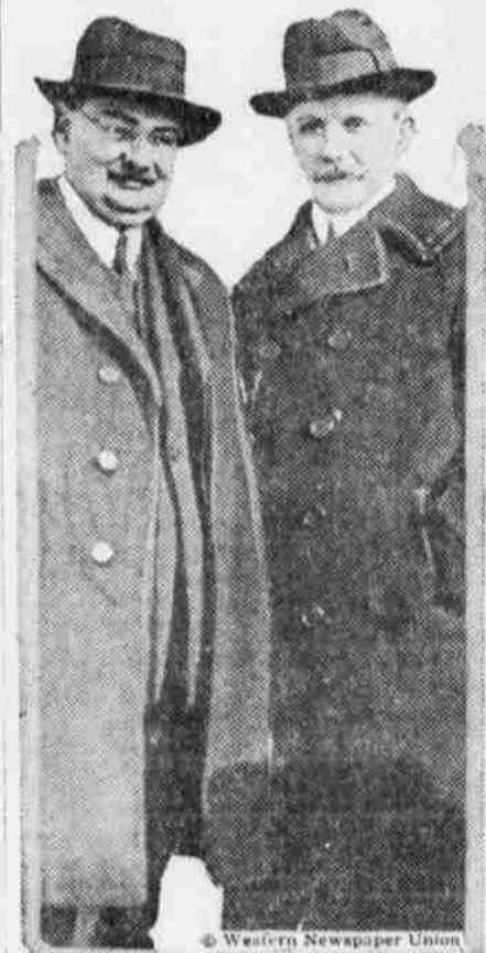
This photograph of Ludwig C. A. K. Martens (on the right), self-styled "soviet ambassador" to the United States, and his secretary, was taken in Washington, just previous to Martens' appearance before a senate committee. He promised to tell the senators a lot about the communist party's activities in America.