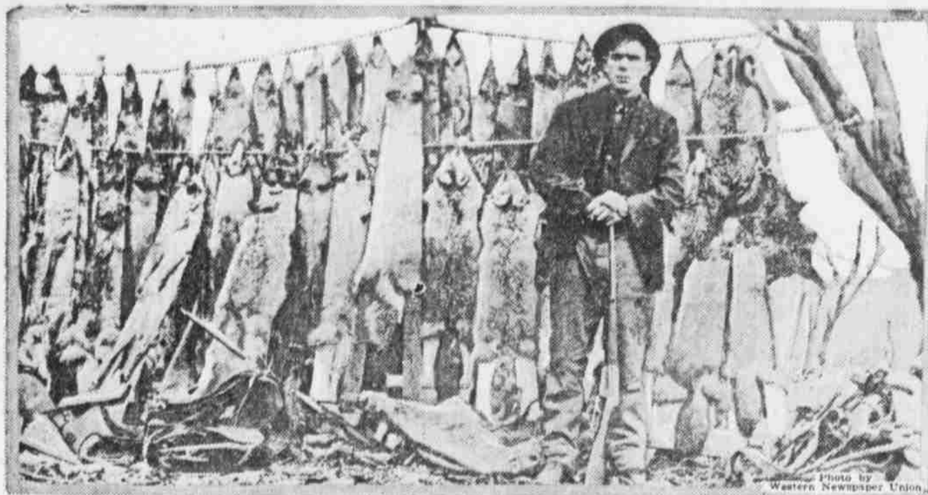
The government, in aid of the farmers who suffer greatly from the depredations of wild animals that destroy crops and live stock, now employs between 400 and 500 professional hunters and trappers. One of them is here shown with his month's catch in Idaho.